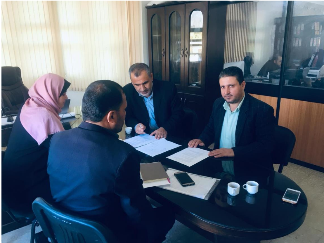
Meeting with Beit Hanoun Municipality