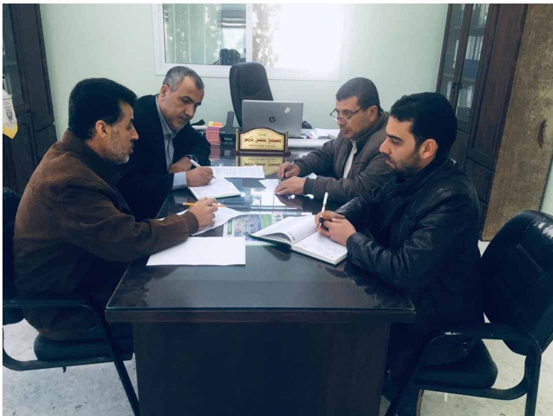
Meeting with Um Al Naser Municipality