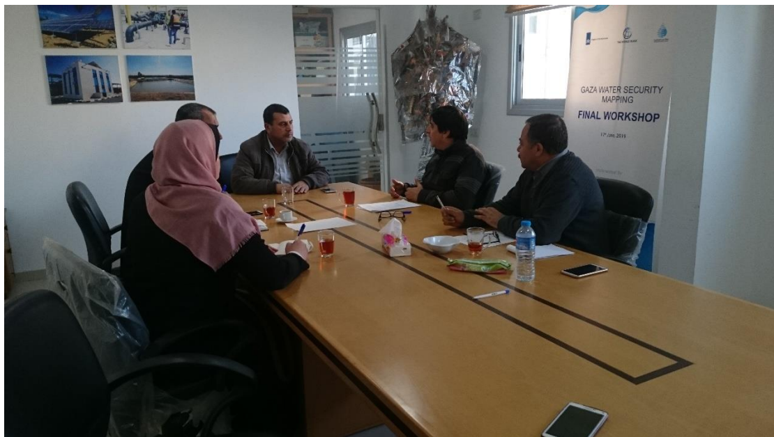
Meeting with EQA and the Ministry of Agriculture