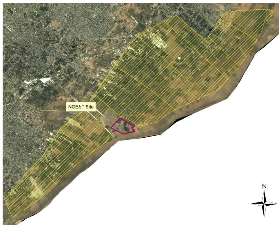
Figure 3-2: Area to be irrigated through the recovery network in the future