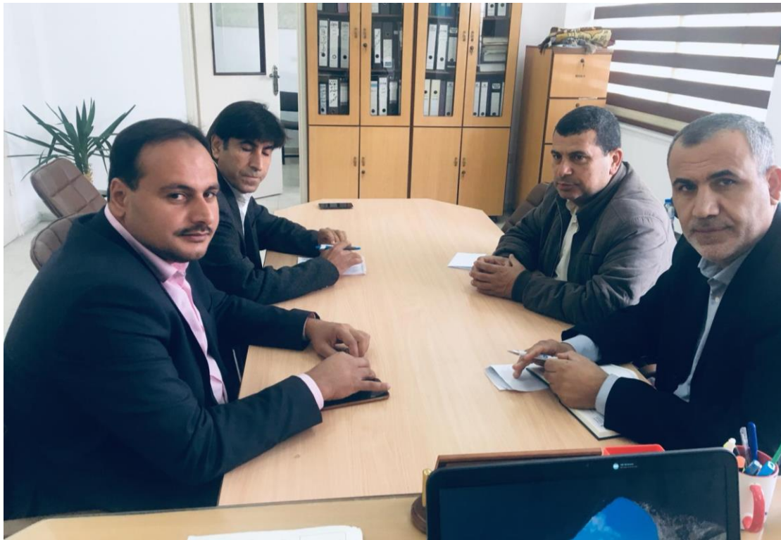
Meeting with Beit Lahia Municipality