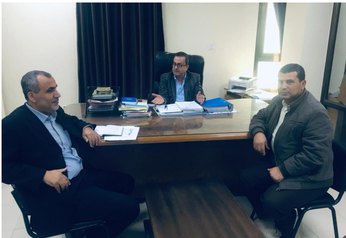
Meeting with Jabalia Municipality