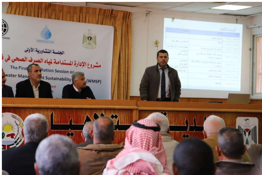
Presentation of Draft SEP and GRM