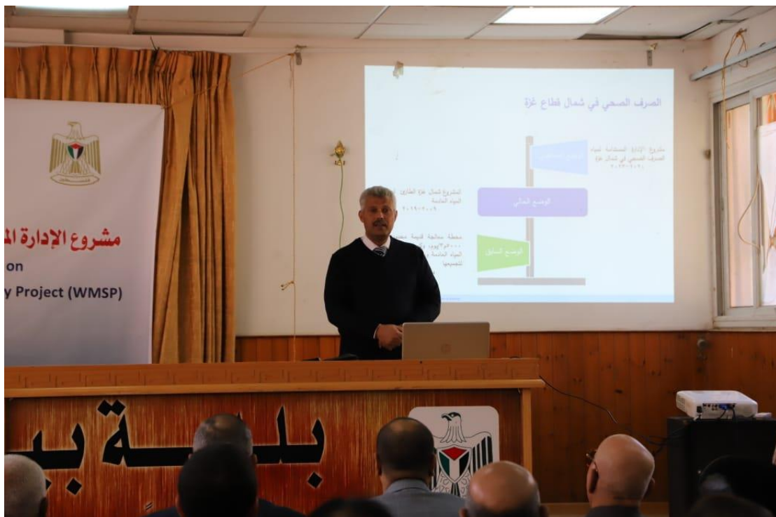
Presentation of Project components and activities