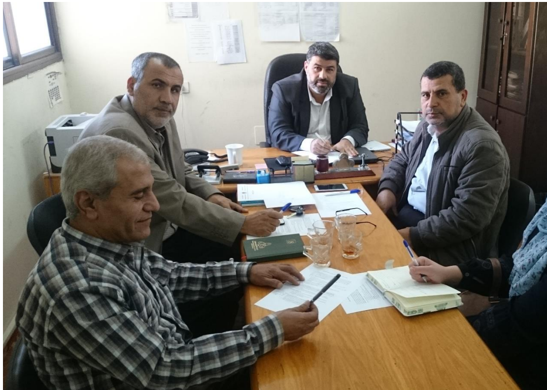
Meeting with EQA and the Ministry of Health