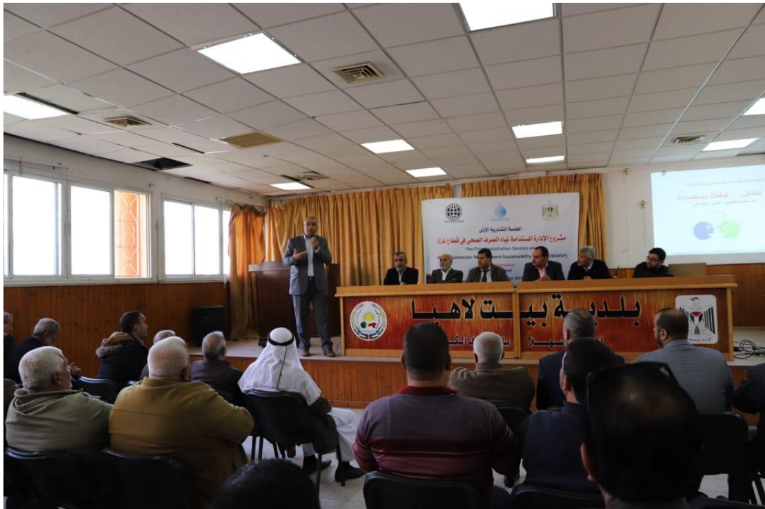
Discussion lead by the Social Expert