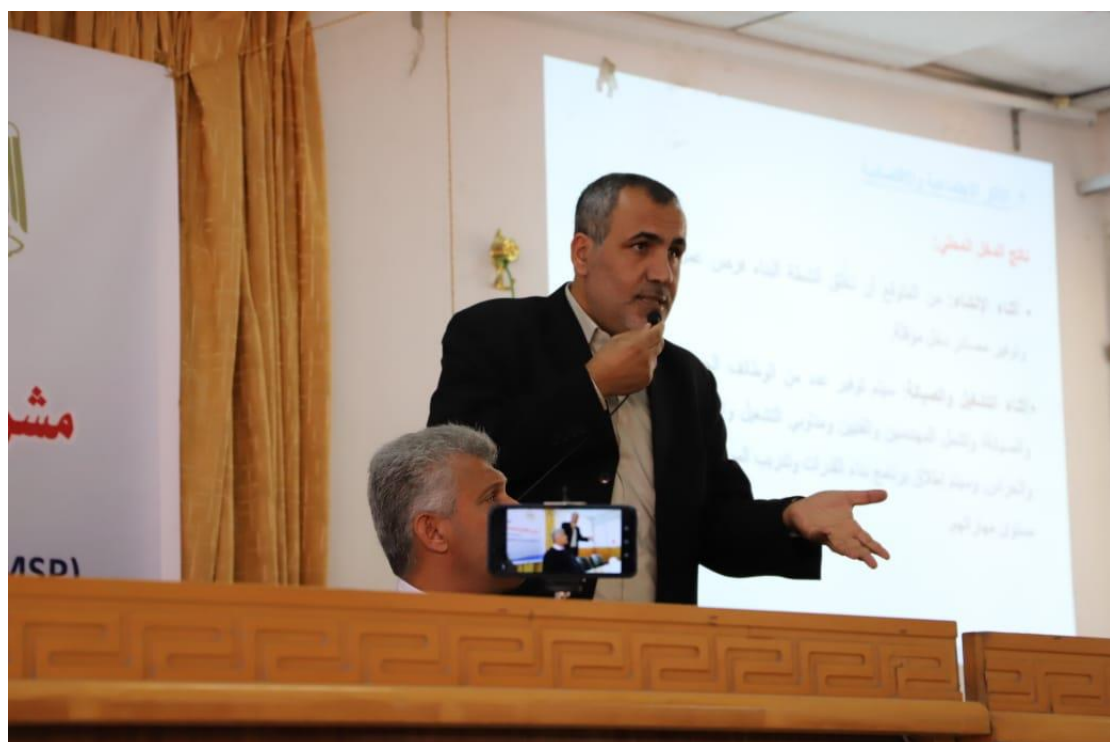
Presentation of Project E&amp;S Impacts